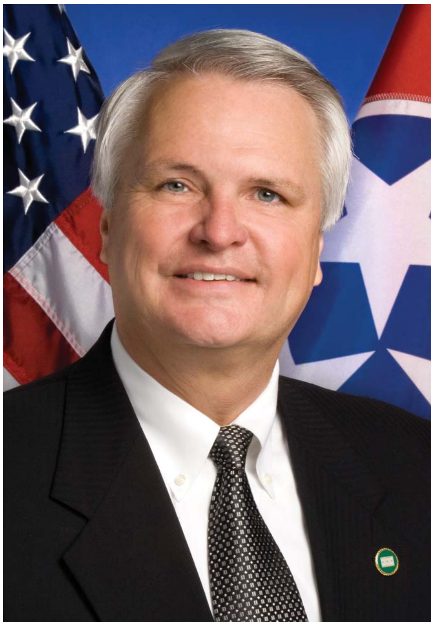
RONALD L. RAMSEY Speaker of the Senate and Lieutenant Governor