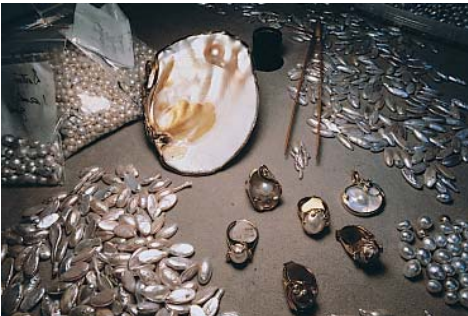
Tennessee River Pearls

The pearl, taken from mussels in the fresh water rivers of the state, is the official state gem, as designated by 1979 Public Chapter 192 of the 91st General Assembly.