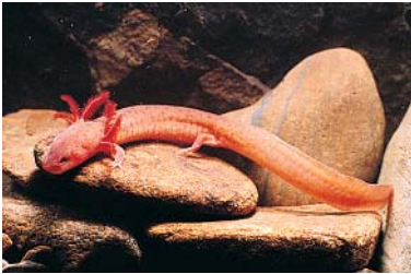
Tennessee Cave Salamander