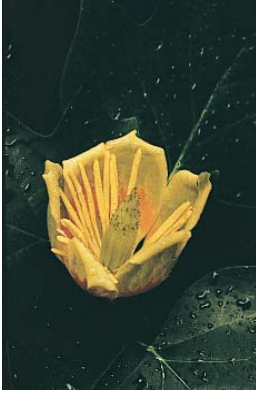
Tulip Poplar Bloom

The tulip poplar was designated as the official state tree of Tennessee by Public Chapter 204 of the Acts of the 1947 General Assembly. The act stated that, as no state tree had ever before been designated, the adoption of an official tree seemed appropriate. The tulip poplar was chosen “because it grows from one end of the state to the other” and “was extensively used by the pioneers of the state to construct houses, barns, and other necessary farm buildings.”