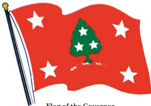
Flag of the Governor

The state of Andrew Jackson—"Old Hickory"—Tennessee, was the Sixteenth state admitted to the union, the original 13 plus 3, and the state flag bears three white stars. The predominant original white population within the state was of English origin, and the twists of the wreath are accordingly white and red. This design was placed upon a red background in the corners of which are placed a 5-pointed star representing the fact that the governor of the state by virtue of his office automatically becomes commander in chief of the National Guard of that state.