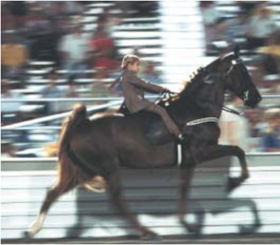
Tennessee Walking Horse

The Tennessee Walking Horse was named the official state horse by Public Chapter 596 of the 101st General Assembly in 2000.