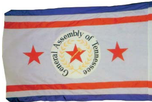
Flag of the General Assembly