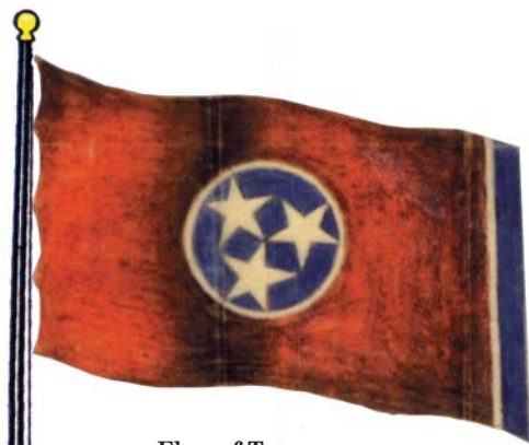
Flag of Tennessee Artist's Original Sketch