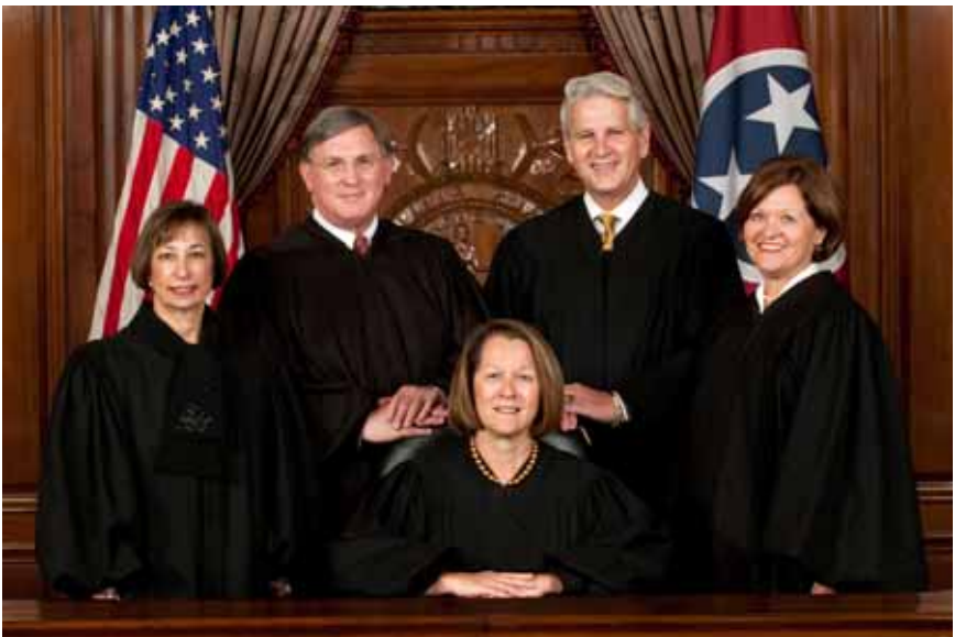
Supreme Court Justices

The five justices may accept appeals of civil and criminal cases from lower state courts. They also interpret the laws and Constitutions of Tennessee and the United States. The Supreme Court may assume jurisdiction over undecided cases in the Court of Appeals or Court of Criminal Appeals when there is special need for a speedy decision. The court also has appellate jurisdiction in cases involving state taxes, the right to hold public office, and issues of constitutional law.