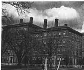
10 Universities With The Richest Alumni Bankrate