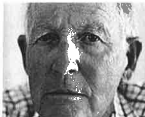
'Warren Buffett Indicator' Signals Collapse in Stock Market Moneynews