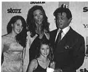
9 Actors that Hate Democrats Republican Reader